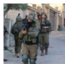
IDF investigating massive theft of ammunition from base in the Negev